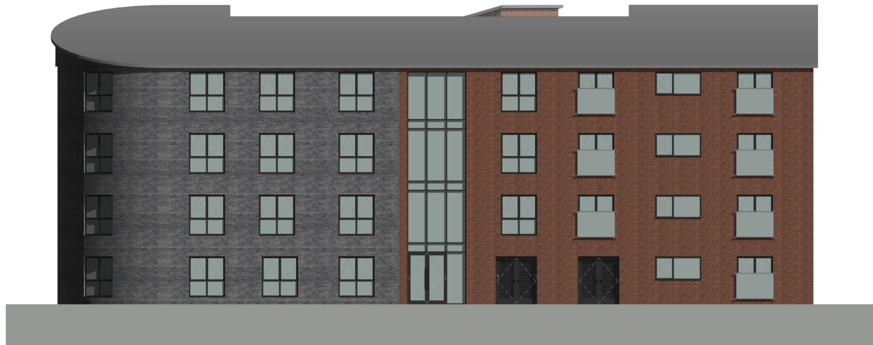
3 West 1 : 100