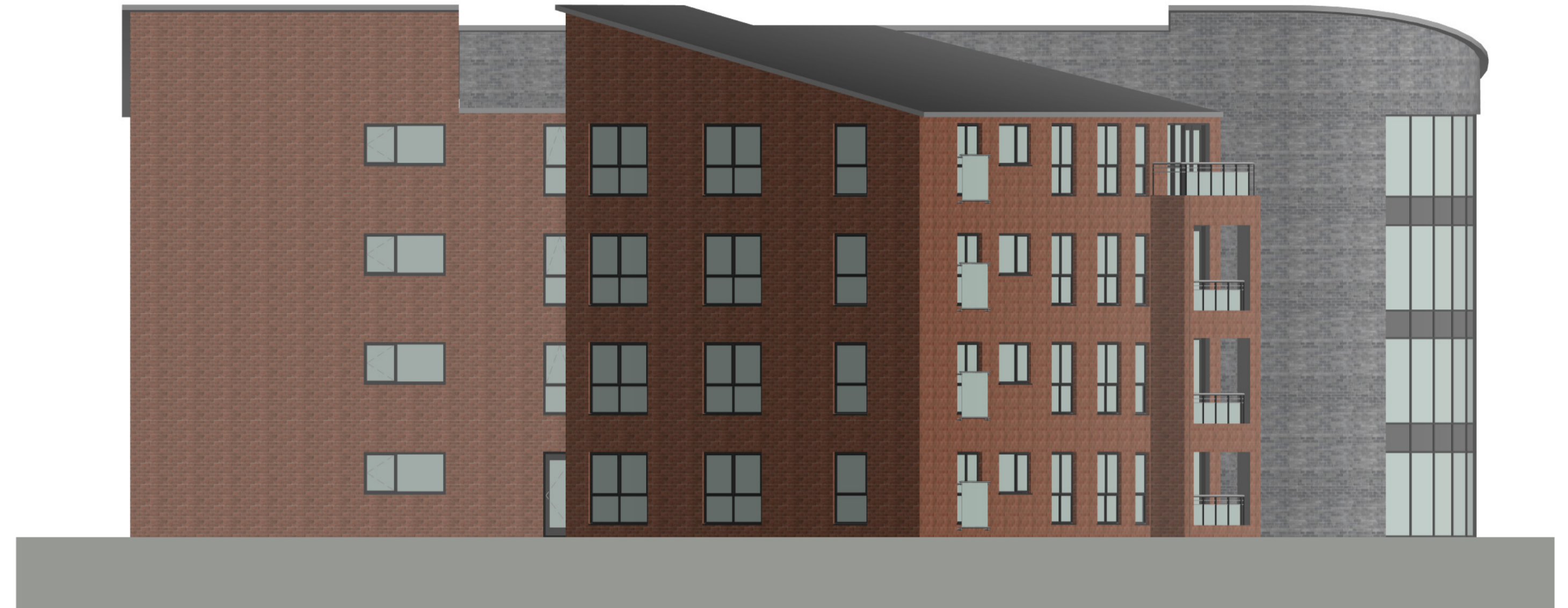
2 East 1 : 100