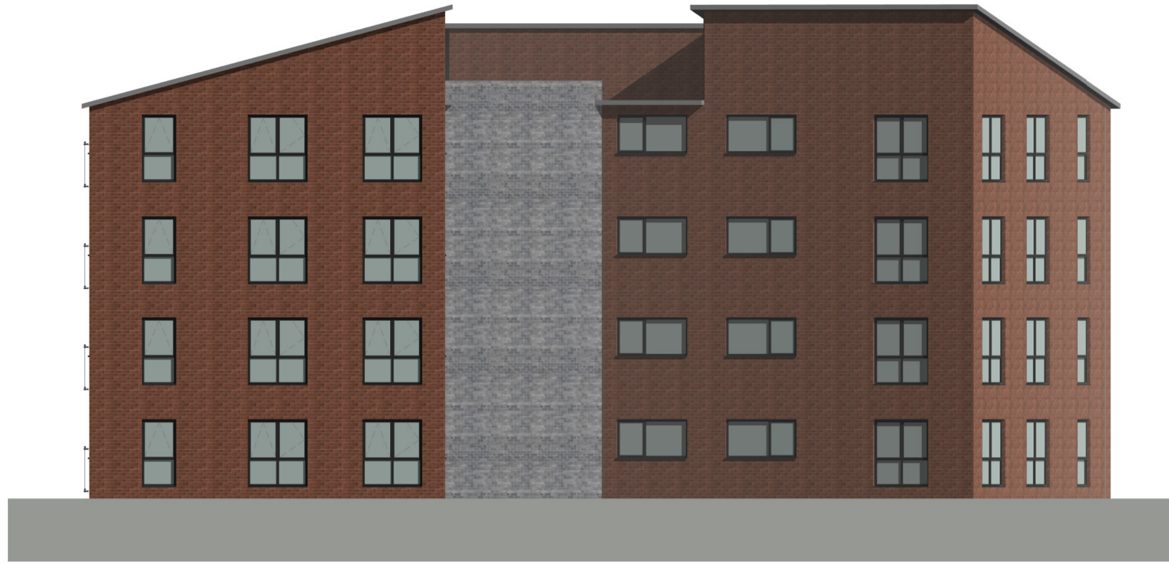
1 South 1 : 100